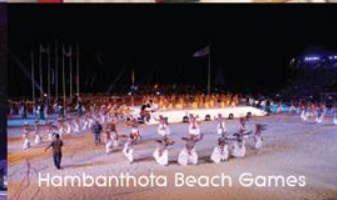
Hambanthota Beach Games