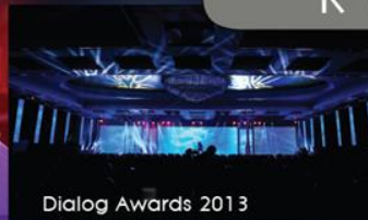
Dialog Awards 2013