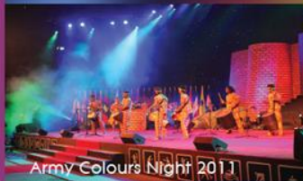
Army Colours Night 2011

WE AT the Lighthouse Rental & Staging Division live by the credo—"You only get one opportunity to make a first impression". We know just how important getting it spectacularly right and impeccably perfect the very first time around is. This is why over the last 15 years we have committed ourselves to procuring for you, our valued clients, only the very best in cutting-edge world-class equipment. But of course, equipment is only half the battle when it comes to conceiving and executing a spectacular and unforgettable event. What really brings an event to life is the people—people with passion, expertise and experience—and this perfectly describes our specialist team of professionals. Whether your extravaganza is a product launch or a wedding, a concert or a conference—trust Lighthouse Rental & Staging, put your mind at ease, focus on your guests, we'll take care of the rest.