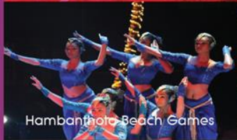
Hambanthota Beach Games