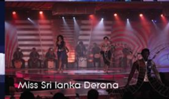
Miss Sri Lanka Derana