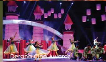
Derana Cine Awards