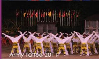
Army Tattoo 2011