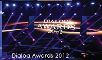
Dialog Awards 2012