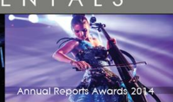
Annual Reports Awards 2014