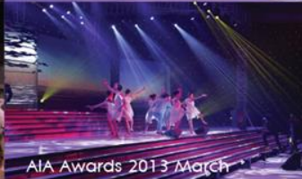
AIA Awards 2013 March