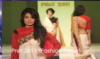
Preet 2011 (Fashion Show)